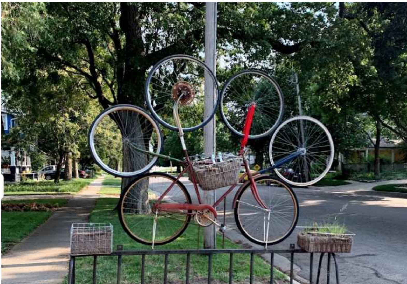
"RE-CYCLED ART" AT R COFFEEHOUSE 1144 BITTING, SOUTH OF 13TH ST IN RIVERSIDE.