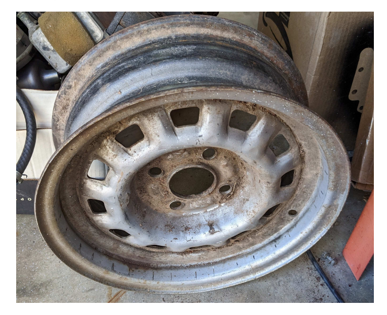
wheel for your midget, CALL ME at 990-2533.