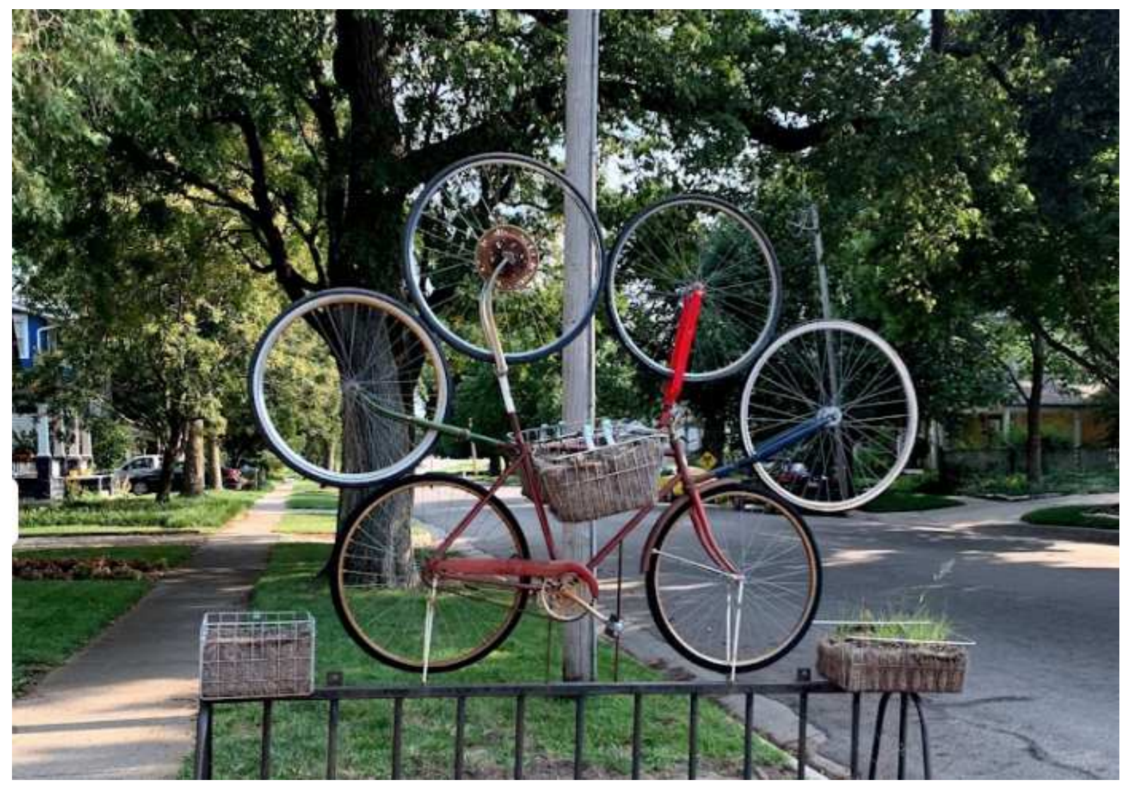
"RE-CYCLED ART" AT R COFFEEHOUSE 1144 BITTING, SOUTH OF 13TH ST IN RIVERSIDE.