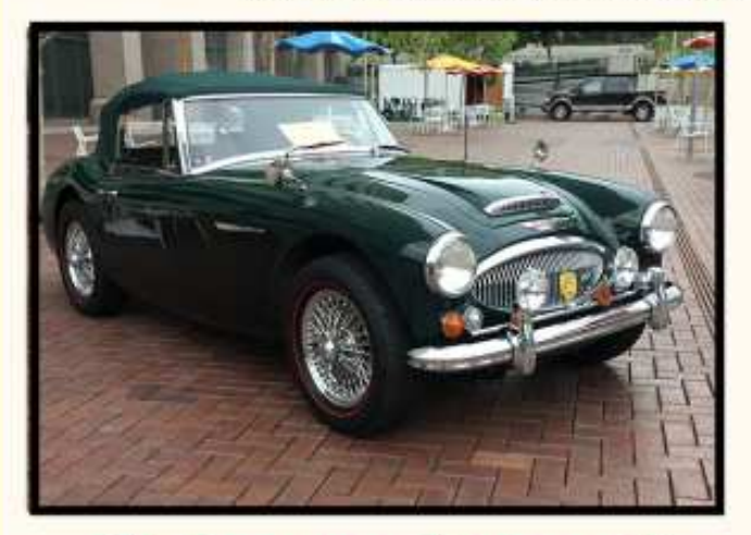
We hope you'll join us!!

The Austin-Healey Club of Kansas City and the Heart of America Jaguar Club are hosting a car show on the beautiful Square at Crown Center. Including cars from the Mini Enthusiasts Club, we will also feature cars from the Lotus Group, the Rolls Royce Owners Club and any and all examples from the wonderful world of British Motorcars.