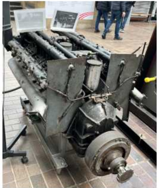
"Pieces of the Sunbeam 200-mph car from 1927. One engine is finished and the second engine is still on display."