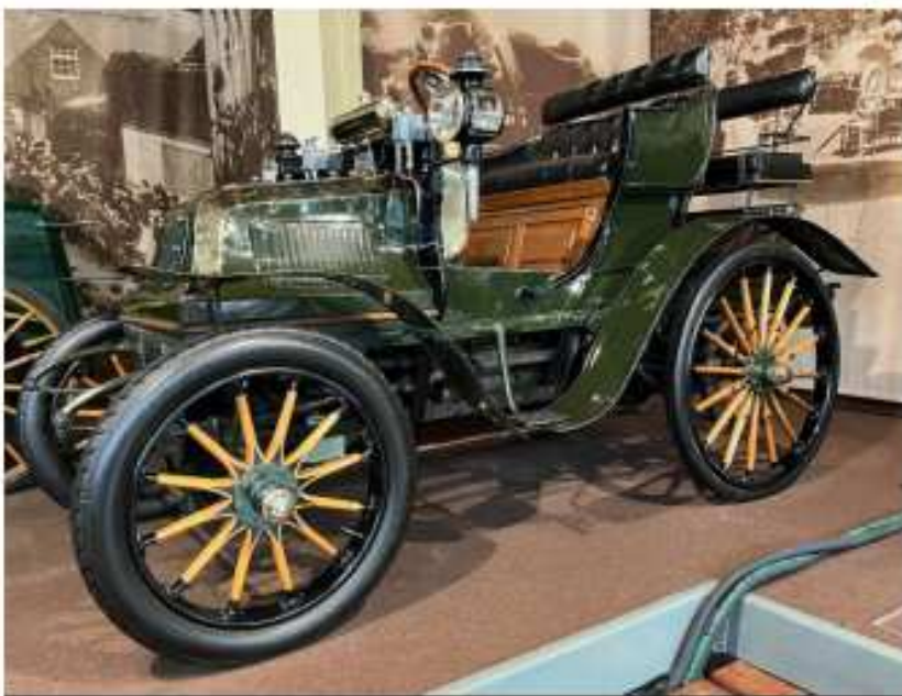
This is the 1899 Daimler, 12 hp . It is one of the two first British cars to run in a European race.