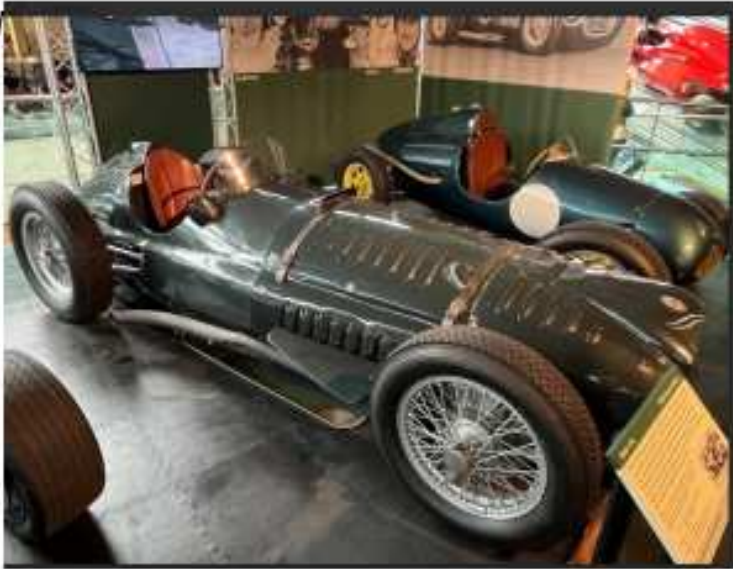
This 1950 Type 15 BRM (British Racing Motors) had a supercharger 1.5 V16 and was the first road-racing car to have disk brakes.