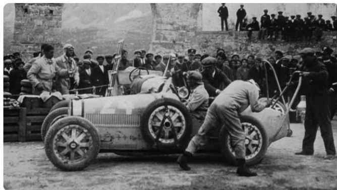
The Tiny Sports Car that Changed the World