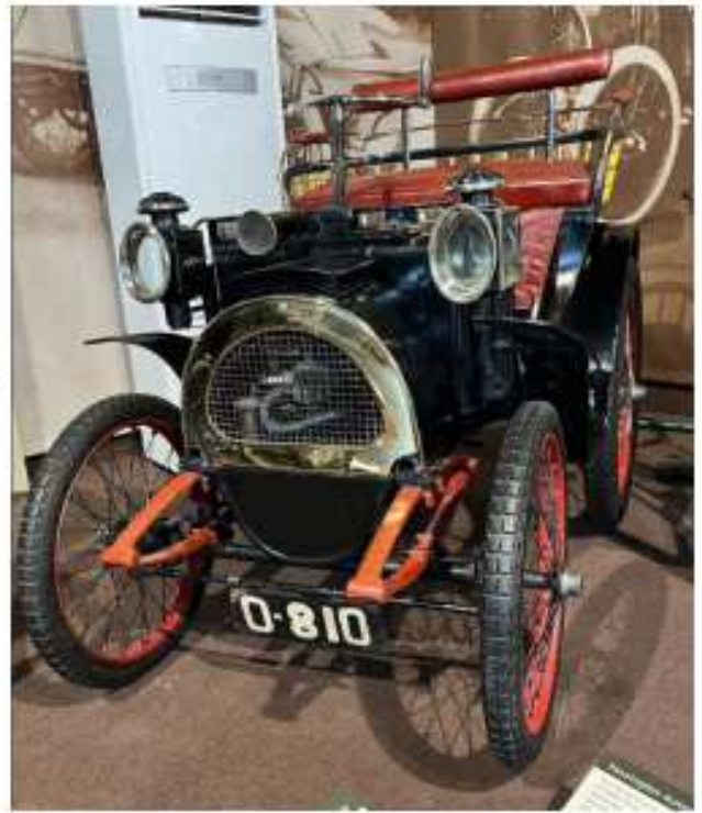
This is an 1894 Bremer . It is believed to be the First British 4-Wheeled Motorcar .